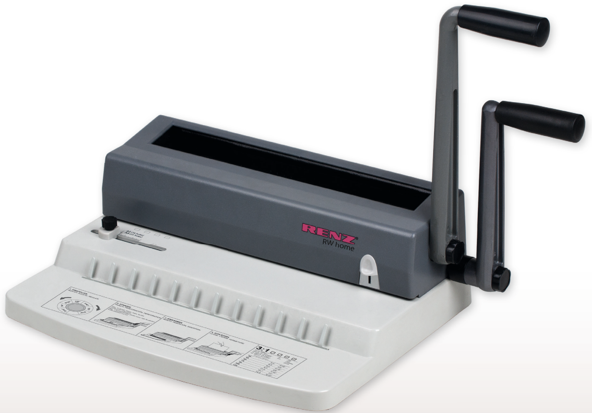
Illustrated: RW home

Entry-level desktop home range for punching and RENZ RING WIRE® binding. For use with low volumes of books at home.