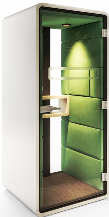
Table for notebook

Shelf dimensions 778 (W) x220 (D) x276 (H), fixed to the middle column, made of middle-density fiberboard (MDF), 38 mm thickness, lacquered.