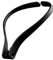
Neck Mount Dimensions: 9.381" x 6.018" x 1.784"