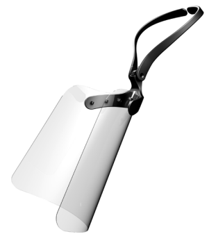
Assembled Shield: Idle State