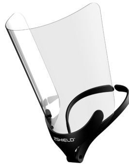
Assembled Shield: Active State