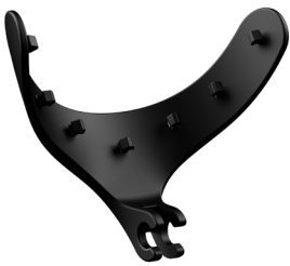
Shield Bracket Dimensions: 5.34" x 2.46" x 3.9"