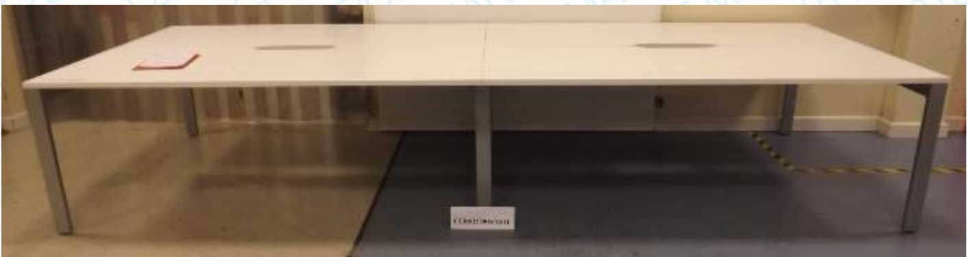
Picture 2: Side view of the 'Switch 4 Person Desk (4 x desktop 2000mm x 800mm with scallops)'