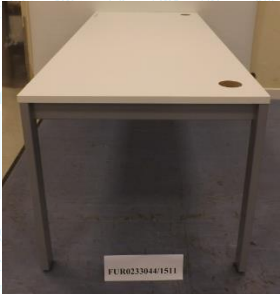
End view of the 'Switch 2000mm x 800mm Single Person Desk'