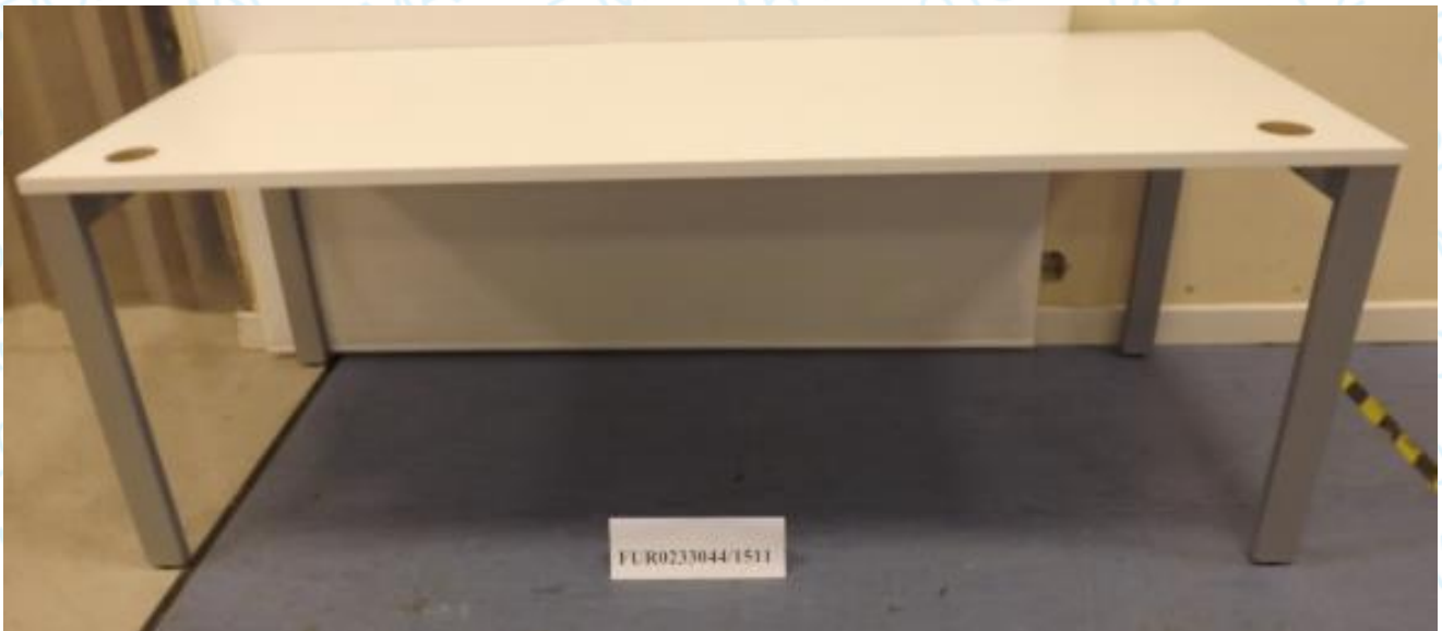
Side view of the 'Switch 2000mm x 800mm Single Person Desk'

Based on the testing of the smallest table (see this report FUR 0233044) and the largest tables (see SATRA report FUR0233046) in the range, it can be concluded that all tables in the "Switch Range" satisfy the requirements of BS EN 527-1: 2011 – Office furniture – Work tables and desks – Dimensions, †BS EN 527-2: 2002 – Office furniture – Work tables and desks – Mechanical safety requirements and BS EN 527-3: 2003 – Office furniture – Work tables and desks – Methods of test for the determination of the stability and the mechanical strength of the structure.