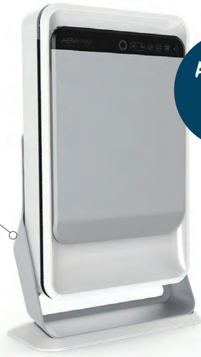
AERAMAX PRO 2 15m 2

With an Aeramax™ Pro PureView model, the invisible becomes visible! Two high grade laser particle counters monitor air quality in and out. Particle (PM2.5) and VOC data displayed