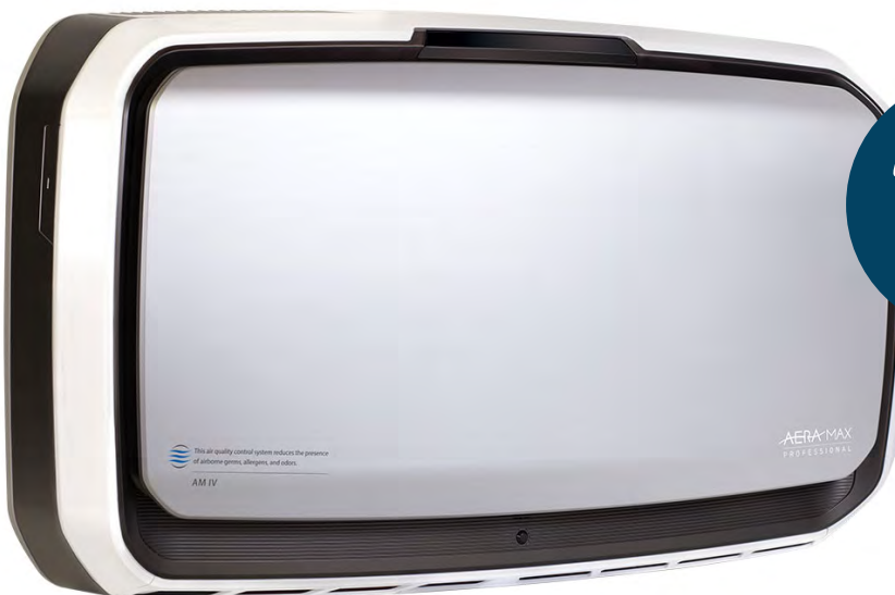
AERAMAX PRO 4 65m 2