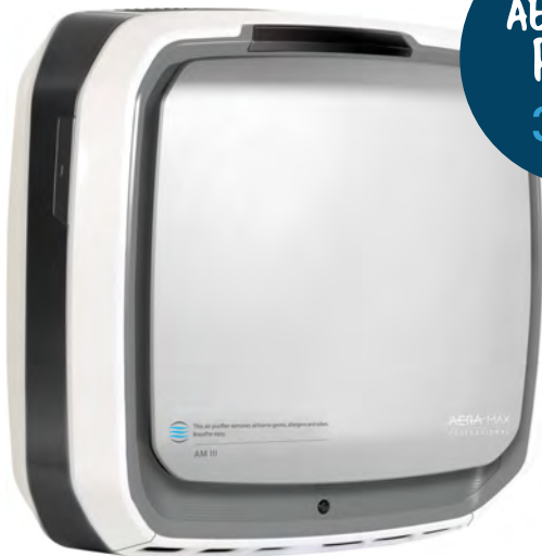
AERAMAX PRO 3 30m 2

Aeramax™ Pro Air Purifiers available in either standalone or wall mounted models