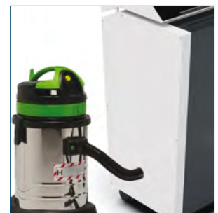
OPTION: DCS-500 complete dust collection system to provide dust free padding mats