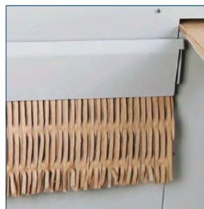
Adjustable cushioning volume of hard and strong carton