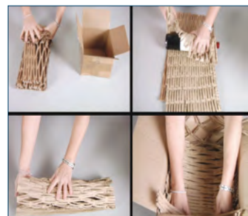
Padding mats from corrugated cardboards