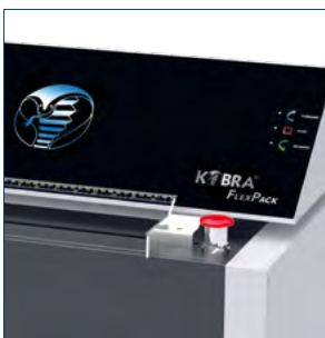
Touch Screen Panel