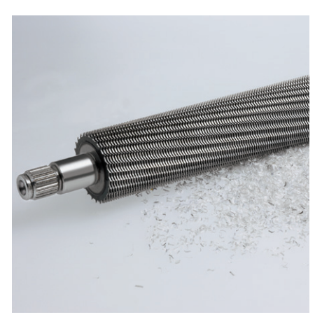
SOLID STEEL CUTTING SHAFTS

Robust and durable: high-quality paper clip proof cutting shafts with lifetime guarantee under conditions of fair wear and tear (except fine cut models MC and SMC).