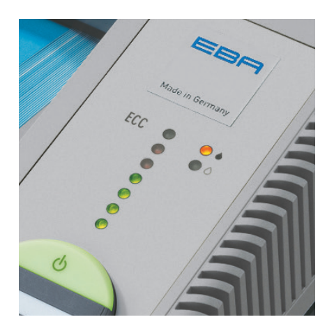
ECC – ELECTRONIC CAPACITY CONTROL This electronic feature indicates the used sheet capacity during shredding process to avoid paper jams.

Ease of operation: intelligent multifunction switch element with integrated optical signals indicating the operational status. Additional "emergency switch" function.