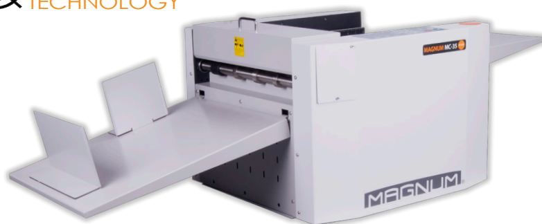
▲ MC-35 (optional stand available)