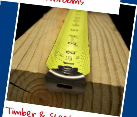
Timber & Sheet Materials