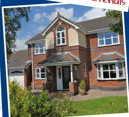
Doors & Windows