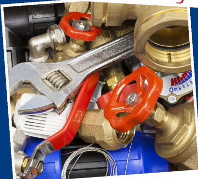
Plumbing & Heating