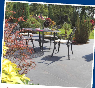
Landscaping & Fencing