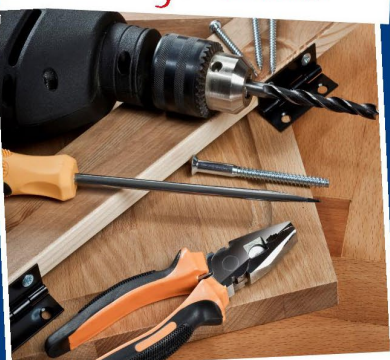
Ironmongery & Tools