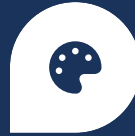
Colour Screen display

The Elvion Neo is a trusted and popular domestic water softener, built around an exceptionally reliable control valve. This high-quality, meter-controlled system combines compact design with practicality, allowing it to fit neatly into any kitchen or utility room.