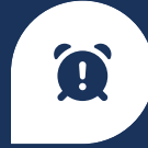
Resin maintenance reminder