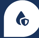
Intelligent leakage protection