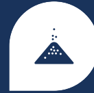
Easy Salt Filling