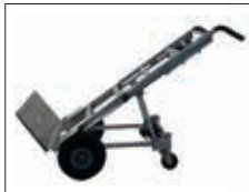
Supported sack truck