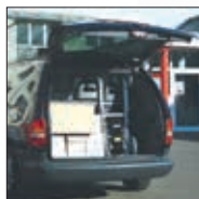
Space saving fold down handle