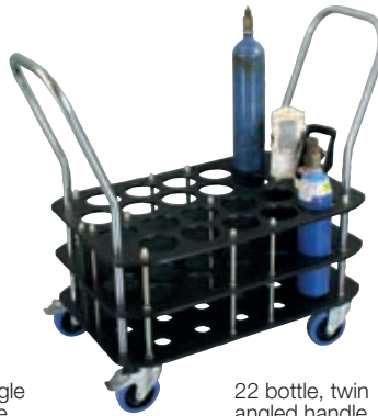
22 bottle, twin angled handle