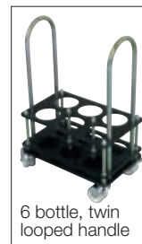
6 bottle, twin looped handle