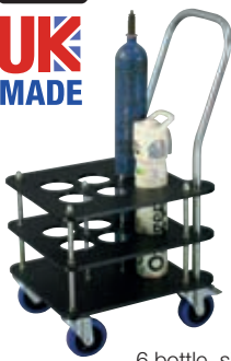
6 bottle, single angled handle