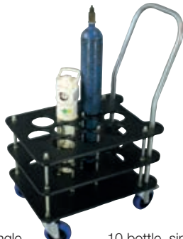
10 bottle, single angled handle