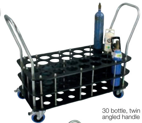
30 bottle, twin angled handle